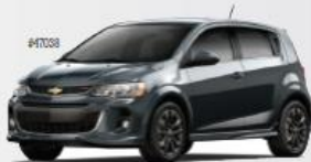
NEW 2017 CHEVY SONIC LT HATCHBACK NIGHTFALL GRAY, RS

SALE PRICE $38,920 MUST FINANCE THROUGH DEALER