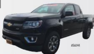
NEW 2016 CHEVY COLORADO EXT. CAB BLACK, V6, 27L, 4WD

LEASE FOR $399 /mo. 39 MONTHS, 10K ML + TAX, 1ST PAYMENT, LIC., DOC FEE DUE ON DELIVERY