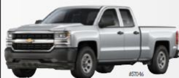
NEW 2017 CHEVY SILVERADO LT DOUBLE CAB SILVER ICE, ALL-STAR, 4WD

LEASE FOR $399 /mo. 39 MONTHS, 10K ML + TAX, 1ST PAYMENT, LIC., DOC FEE DUE ON DELIVERY