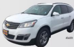
NEW 2016 CHEVY TRAVERSE LT SUMMIT WHITE, 7 PASSENGER, DEMO

SALE PRICE $28,970 MUST FINANCE THROUGH DEALER