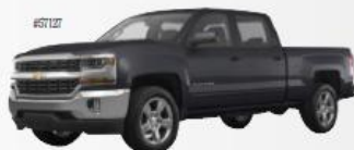
NEW 2017 CHEVY SILVERADO LT CREW CAB GRANITE METALLIC, ALL-STAR, 4WD

SALE PRICE $38,920 MUST FINANCE THROUGH DEALER