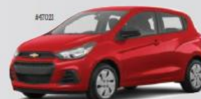
NEW 2017 CHEVY SPARK LS RED HOT

SALE PRICE $6,250 off MUST FINANCE THROUGH DEALER