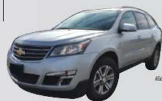
NEW 2016 CHEVY TRAVERSE LT SILVER ICE, 7 PASSENGER, DEMO

SALE PRICE $28,970 MUST FINANCE THROUGH DEALER