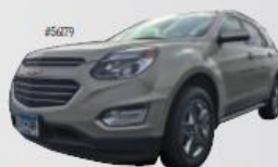
NEW 2016 CHEVY EQUINOX LT CHAMPAGNE SILVER, REMOTE START, HEATED SEATS

SALE PRICE $6,250 off MUST FINANCE THROUGH DEALER