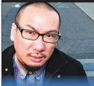
AUTHOR BAO PHI