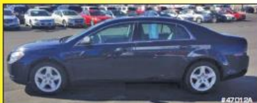
2010 Chewy MALIBU LS