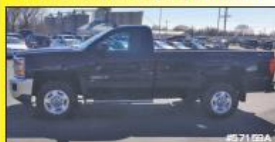
2015 Chevy Silverado 2500 HD LT