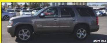
2013 Chewy TAHOE LTZ