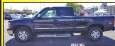
2002 Chevy Silverado 1500