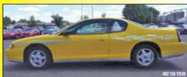
2005 Chevy MONTE CARLO LS