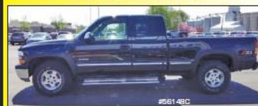
2002 Chevy Silverado 1500