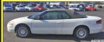
2006 Chrysler SEBRING TOURING