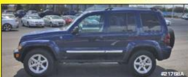
2005 Jeep LIBERTY LIMITED