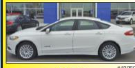
2014 Ford FUSION HYBRID SD