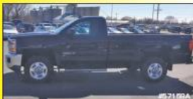
2015 Chevy Silverado 2500 HD LT