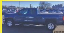
2015 Chevy Silverado 1500 LT