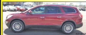
2011 Buick ENCLAVE CXL 1XL