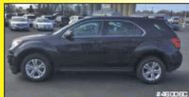
2015 CHEVY EQUINOX LS