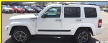
2008 Jeep LIBERTY SPORT