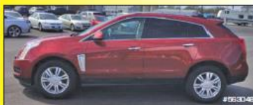
2013 Cadillac SRX LUXURY