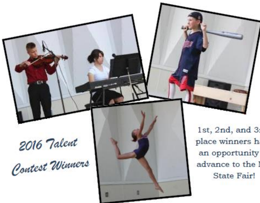
2016 Talent Contest Winners

1st, 2nd, and 3rd* place winners have an opportunity to advance to the MN State Fair!