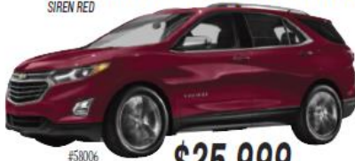
NEW 2018 CHEVY EQUINOX LT AWD SIREN RED