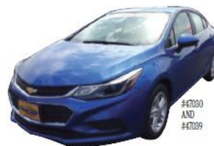
NEW 2017 CHEVY CRUZE LT KINETIC BLUE